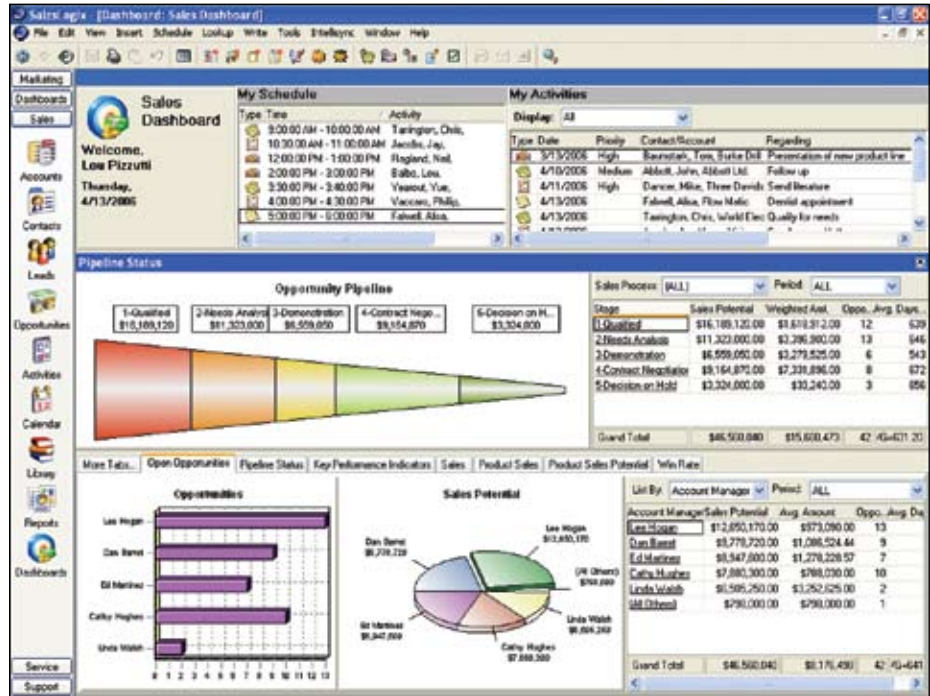
View performance metrics, diagnose key issues, and identify opportunities from a single location with Sage CRM SalesLogix Dashboards.